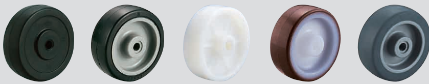
R RH NR N UR EL Rubber wheel Rubber wheel with nylon wheel assembly Nylon wheel Urethane wheel with nylon wheel assembly Elastomer wheel

Refer to P163 for detailed specifications.