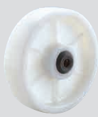
N Nylon wheel (including B)