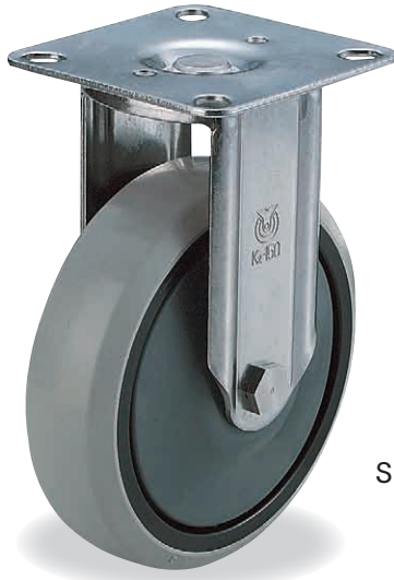
SUS-GUK 2 -150