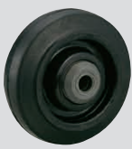
NR Rubber wheel with nylon wheel assembly (including B)

Refer to P162 for detailed specifications.