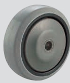
GU Urethane wheel with nylon wheel assembly (including B)