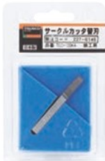
TCC-125KA (replacement blade)