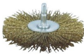
TB-6251-60 (brass plating steel wire)