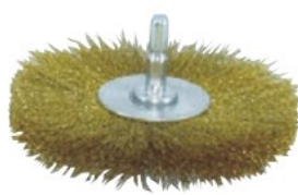
TB-6254-60 (brass wire)

Contact us: 0120-509-849 http://www.orange-book.com/