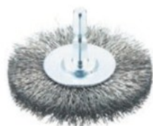
TB-6233-60 (stainless steel)