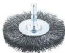
TB-6232-60 (wire steel wire)