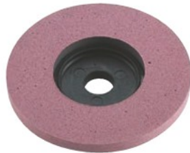
TSPA100-P (for non-metal)