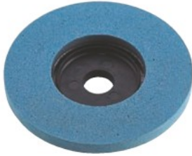
TSPA100-B (for metal)