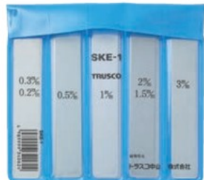
SKE-1 (15 sheets set)