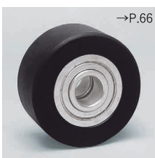
MCMO (Monomer cast nylon/Black) JBB