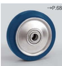
SST (NR) ● Runs more lightly compared with W! ● Impact resistance: 1.8 times higher than W. Starting performance: 2.5 times better than W. NB \phi 100, 150 and 200.