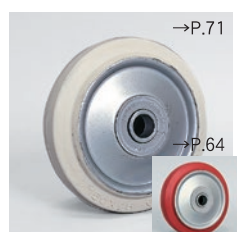
WW (BR) ● Cold resistance (-40°C~+90°C) ● Floor saving and non-marking.