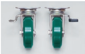
Swivel with stopper (Left/Right)