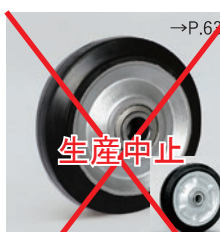
CW (SBR) <Made in China> NB \phi 100, \phi 130, \phi 150 and \phi 200 .

CB ...Pressed bearing JBB ...Radial ball bearing OL ...Oilless bushing