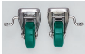
Fixed with stopper (Left/Right)

Plastic tipped end only available for swivel with stopper (Right version).