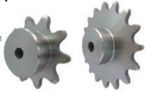
Ground Specification Welded Specification