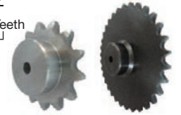
Ground Specification Welded Specification