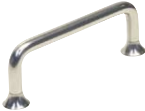
SRH4-A SRH4-B (Straight)