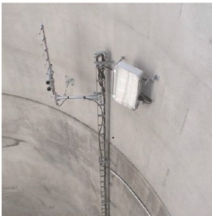
Tunnel Illumination Lamps